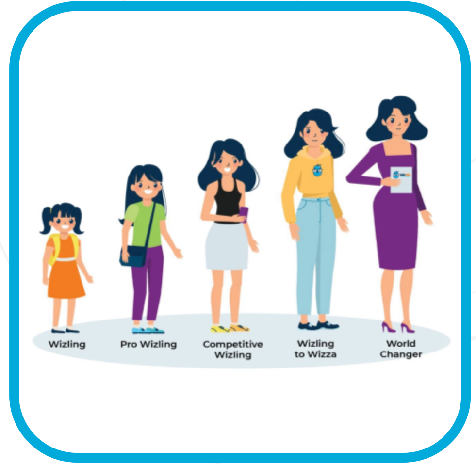
Code Wiz Pathway